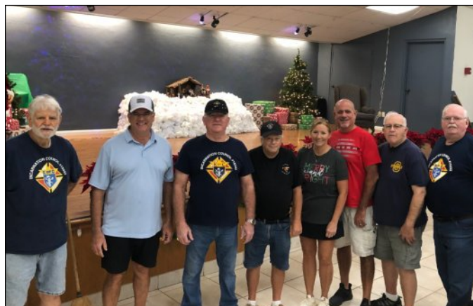
Some of the Volunteers who decorated the Finegan Center for the Parish Christmas Party