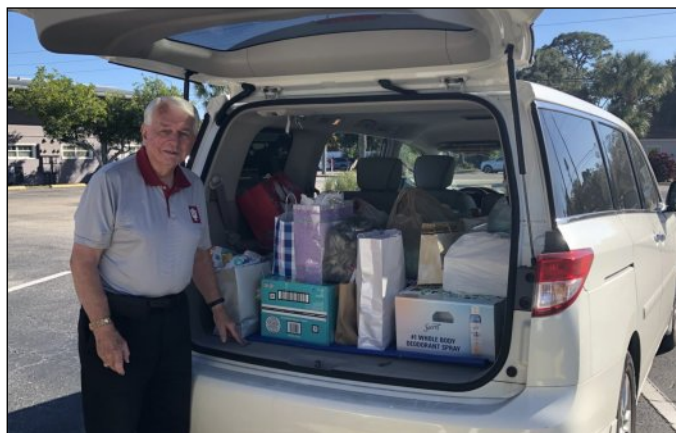
Incarnation Baby Shower for Jesus donations

we thank our parishoners for their continued generosity to this worthy cause.