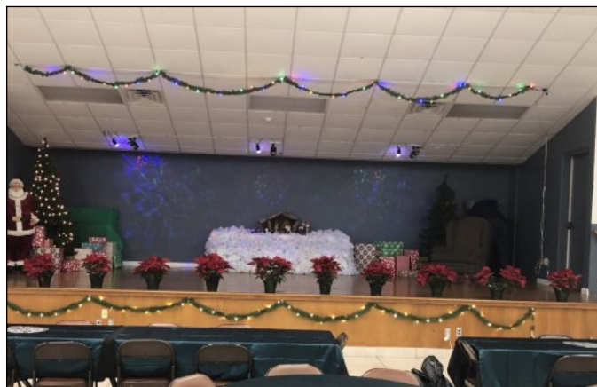
Finegan stage decorated for Parish Christmas Party

On December 13th Our Incarnation Council decorated the Finegan Center in preparation for the Parish Christmas Party.